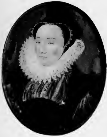
MARY, QUEEN OF SCOTS BY NICHOLAS HILLIARD